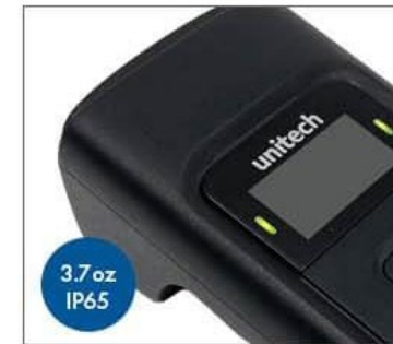
Lightweight and Sturdy

Unitech's RM300 series is a high-performance UHF RFID reader module based on Impinj R2000 chip and compliant with EPC C1 Gen2 / ISO 18000-6C and FCC modular approval requirements. System Integrators, RFID device makers could use RM300 to develop their own products with the benefits of cost-efficiency and high-performance.