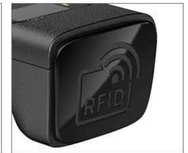
Optimized for Multiple RFID Tags

RFID technology is well on its way to revolutionizing work environments. Don't get caught in the dust - with the RP902, you can be confident that your RFID reading devices are ready to keep you in the lead. Contact a Unitech representative today to learn how you can demo the RP902.