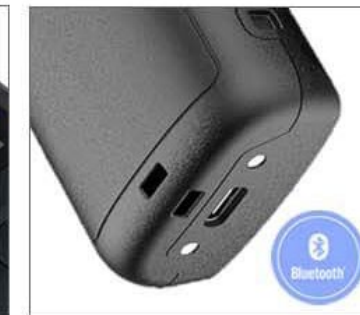
Bluetooth® and with USB Support